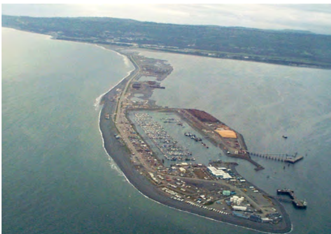
An aerial view of Homer Spit and the harbor in Homer, Alaska, where city officials have developed a plan to mitigate risks associated with climate change.

The city drafted a climate change plan in 2007 that created a baseline inventory of emissions and set a goal of a 20 percent reduction in emissions (from 2000 levels) by 2020. The city was one of the first in the nation