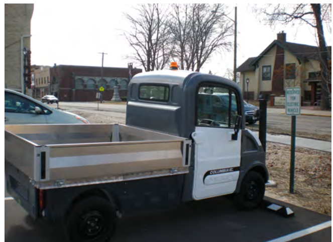
The City of Columbus’ electric truck parked at a plug-in station. The truck will be used for park maintenance and public works functions.

Kraemer reports, when they hear that the city has all high-efficiency LED street lights. “We can turn them on with a laptop and we can change them in high crime areas.” He says it gives them a media and attitude edge over other communities.