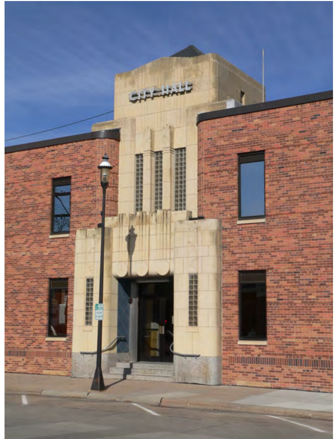
Energy audits were conducted on every municipal building in Kearney, Nebraska, including its City Hall.

In addition to purchasing electric vehicles, they have changed every traffic light to high-efficiency fixtures and are in the process of converting every streetlight. They have conducted energy audits of every municipal building and followed up with major weatherization, HVAC, and lighting improvements