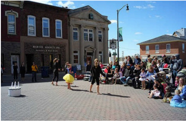
An event taking place in West Liberty, Iowa, where changing street lights to high efficiency fixtures has saved the city 47% in energy costs.

and efficiency projects. Most recently, they purchased a Chevrolet Volt (a plug-in hybrid) from the local dealer for use as the city manager's car. Changing street lights to high efficiency fixtures has saved them 47 percent in energy costs.